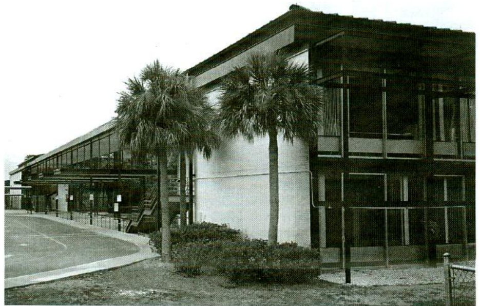
Riverview High School today